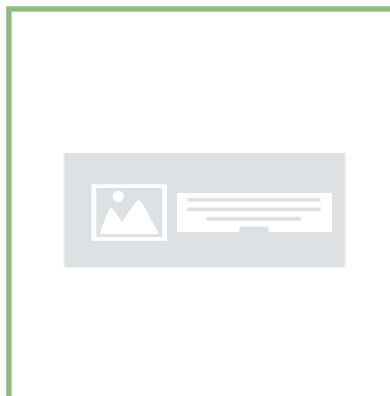
IMAGE - JPEG OR GIF