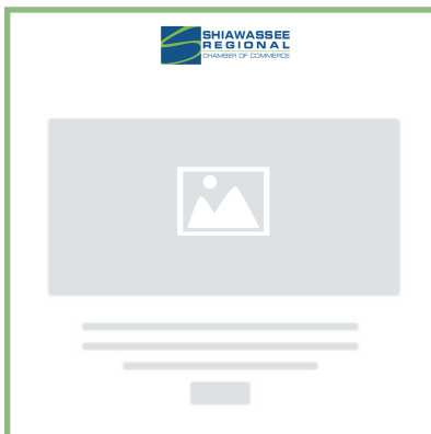
IMAGE - JPEG OR GIF

MIN - 600px x 600px MAX - 1080px x 1080px